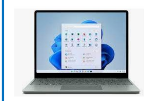
Computing—communication and collaboration